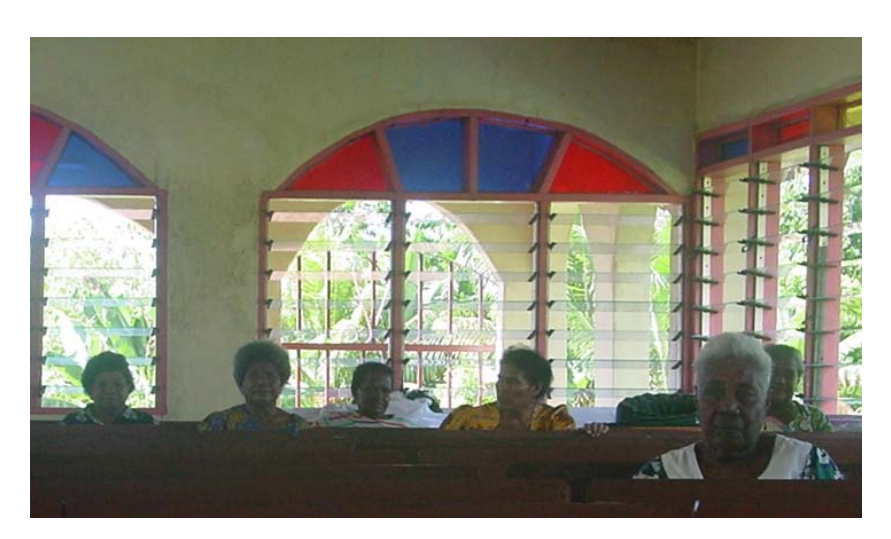
Aele-Fou Community at the Consultation Workshop

Proper business management skills are needed in the sustainability of water resources management.